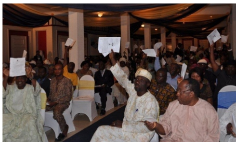
Shareholders endorsing the final merger at the EGM

The successful execution of the Business Combination between Access Bank and Intercontinental Bank signals the reordering that will take place in the hierarchy of top 5 financial institutions in the sector.